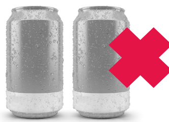
Beer & Cider